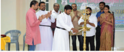
മാർത്തോമ്മാ മതസഭയിൽ ഉറപ്പാക്കലിന്റെ അടയാളമായിട്ടാണ് മേൽ കാണിച്ചിരിക്കുന്ന ചടങ്ങുകൾ നടന്നത്.