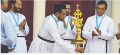
മാർത്തോമ്മാ മതസഭയിൽ ഉറപ്പാക്കലിന്റെ അടയാളമായിട്ടാണ് മേൽ കാണിച്ചിരിക്കുന്ന ചടങ്ങുകൾ നടന്നത്.