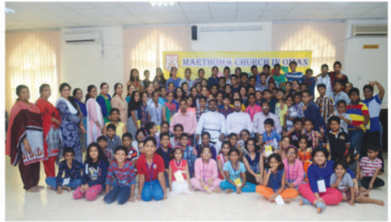
മാർത്തോമ്മാ ചെട്ടി ത്തെ ഓരോ സൗഹൃദപൂർവ്വ ഭവനങ്ങളിലായി കൂട്ടായി 'സമ്മർകാമ്പ് 2016' ജൂലൈ 19,20,21,22 തീയതികളിൽ വാർഷിക 7 ന്നടി മൂത്തയ്ക്ക് ഓരോ 6 ന്നടി വരെ ഓരോ മാർത്തോമ്മാ ചെട്ടിയിൽപ്പെട്ടു നടന്നു. 'Are you 4 G?' എന്ന തീർത്ഥാടനത്തിന് തയ്യാറെടുപ്പിച്ചു. 'Are you 4 G?' എന്ന തീർത്ഥാടനത്തിന് തയ്യാറെടുപ്പിച്ചു. 'Are you 4 G?' എന്ന തീർത്ഥാടനത്തിന് തയ്യാറെടുപ്പിച്ചു.