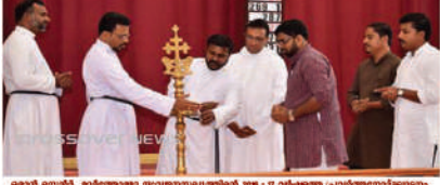
മാർത്തോമ്മാ മതസഭയിൽ ഉറപ്പാക്കലിന്റെ അടയാളമായിട്ടാണ് മേൽ കാണിച്ചിരിക്കുന്ന ചടങ്ങുകൾ നടന്നത്.